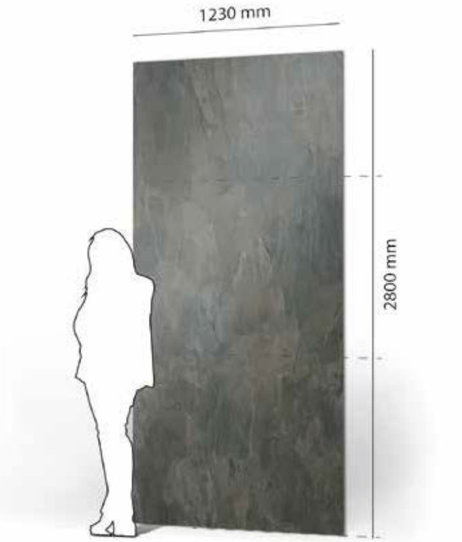
FLANDERS OAK - FN texture